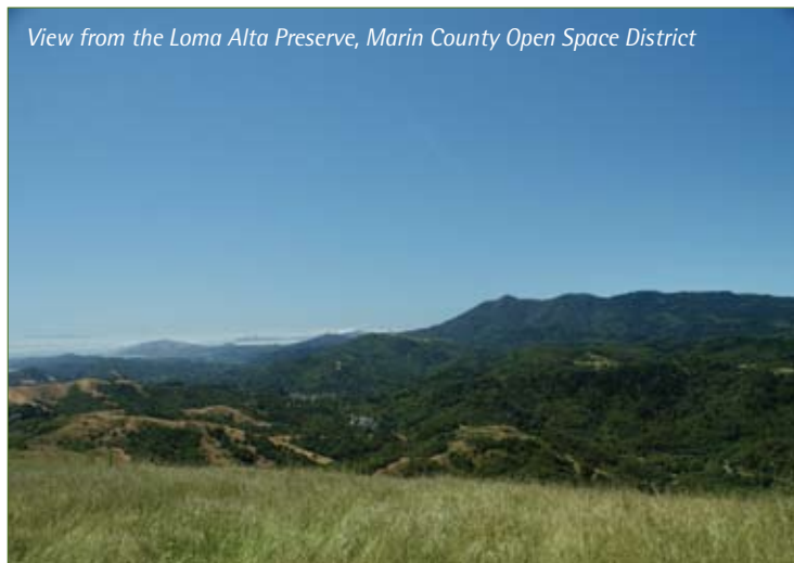
View from the Loma Alta Preserve, Marin County Open Space District