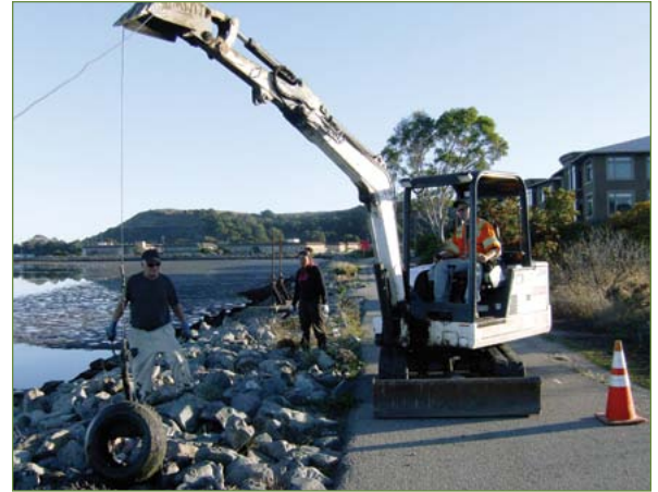
Above: Workers use a winch to remove the tires from the mud. Below: Conservation Corps North Bay workers scrape thick Bay mud from a tire.

With work limited to minus tides, a five-day work week, and a five-month summer-fall "window," the job took three and a half years from permits to conclusion in early 2015. Forty-three abandoned tires, some of them from large earthmoving equipment, plus three tire rims had been removed. It was an all-volunteer effort, led by the "Friends"