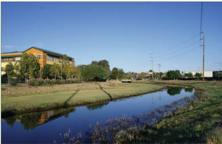
Mahon Creek, which flows into the San Rafael Canal and out to the Bay, is both greenway and likely corridor for rising seas to enter downtown San Rafael.