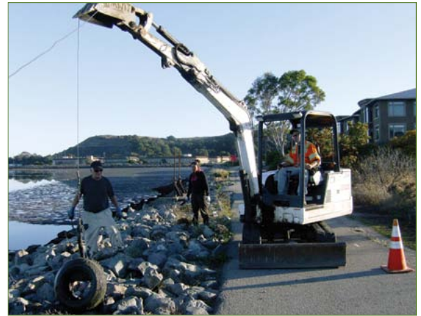
Above: Workers use a winch to remove the tires from the mud. Below: Conservation Corps North Bay workers scrape thick Bay mud from a tire.

With work limited to minus tides, a five-day work week, and a five-month summer-fall "window," the job took three and a half years from permits to conclusion in early 2015. Forty-three abandoned tires, some of them from large earthmoving equipment, plus three tire rims had been removed. It was an all-volunteer effort, led by the "Friends"