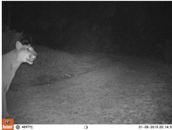
Both of Marin's wild cat species, the mountain lion (left) and the bobcat (below) have been captured by the MWPIP's motion-activated cameras, which do not emit light or disturb the animals.

The MWPIP is a project of the Tamalpais Lands Collaborative (TLC, or "One Tam"), a partnership of MMWD, Marin County Parks, California State Parks, Golden Gate National Recreation Area (GGNRA), and Golden Gate National Parks Conservancy (MCL Newsletters March-April 2014 , January-February 2015 ). The project combines a statistical analysis of photos from cameras with other environmental data to help land managers learn about the abundance, patterns, and trends in wildlife use and behavior on their lands. The Wildlife Picture Index (WPI) technique