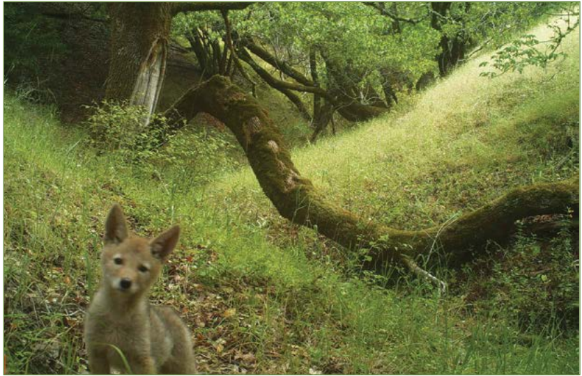
Marin Wildlife Picture Index Project