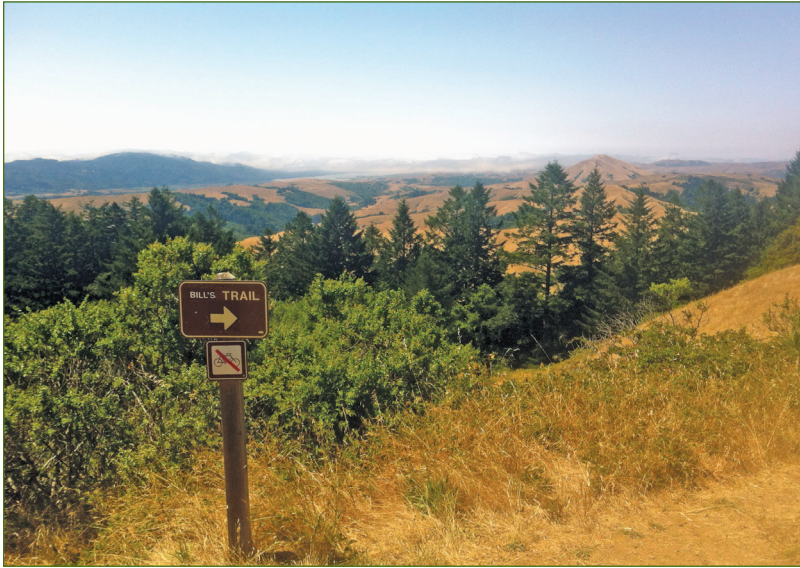
State Parks will soon be removing the 'no bikes' signage at Bills' Trail