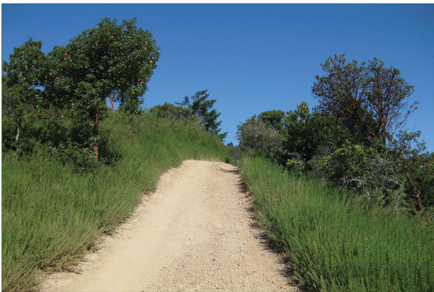
Marin County Parks