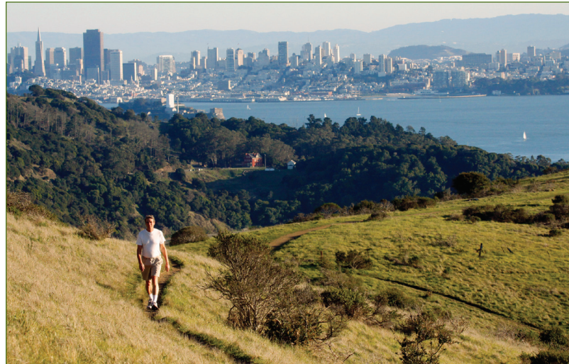
A view looking south of the proposed Easton Pt. development site from the Old St. Hilary Preserve on the Tiburon Ridge.

The outcome of the meeting was an unexpected unanimous decision by Commissioners not to recommend certification! Their recital about the defects in the FEIR closely followed the comments of MCL and many others. The DEIR offered no alternative that could "substantially" reduce the impacts (e.g., grading, construction traffic, visual, tree removal, and landslide repair-related) by reducing house and lot size, and the FEIR ignored the request by many to consider an alternative featuring