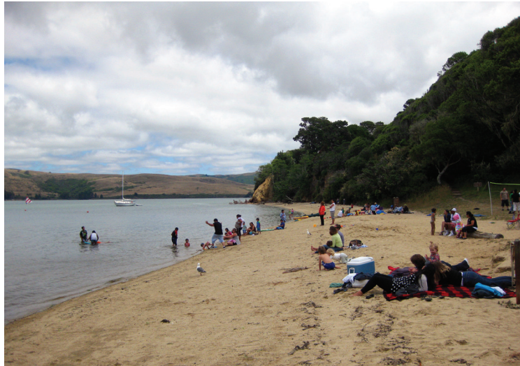
Visitors from around the Bay Area visit Tomales Bay State Park in the summer months.