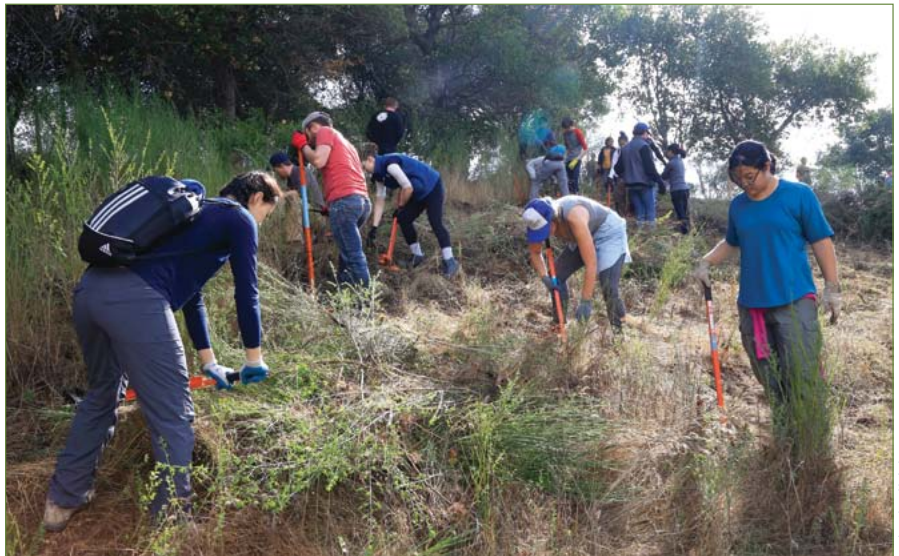
Volunteers use county-provided weed wrenches to remove broom on Horse Hill Preserve in Mill Valley.

Anyone, old or young, with normal strength can pick up a weed wrench and pull out invasive woody plants like French broom. The bright orange tools come in four sizes, including a "mini" that even a toddler can maneuver. With a vigorous pull, the weed wrench will uproot any plant with a stem up to two and a half inches in diameter – even a mature French broom plant. Marin County Parks Department has an ample supply of these tools. The Department also provides a leader to direct the efforts of the many volunteers who help to control invasive weeds on the county's 34 open space preserves.