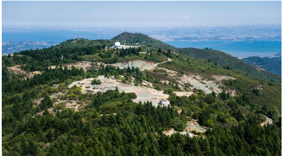
West Peak of Tamalpais, in the foreground, is a prime candidate for restoration.

The concessionaire, Ace Parking Management, Inc., was on hand at the meeting to outline how the system will operate. They began assisting NPS parking staff on December 15 and were scheduled to begin taking reservations on line on January 1. They will continue to assist the