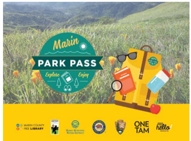
A free pass to county parks is a popular "check out" at Marin libraries.

As the reach of One Tam, which originated in 2014, has expanded, the county has used Measure A funds to partner in ongoing major projects such as the renewal of Roy's Redwoods Open space Preserve in San