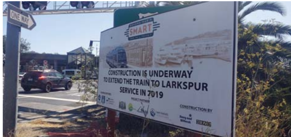
The SMART extension to Larkspur and increasing rail car capacity received funding from the State's cap-and-trade program.

In 2018, California's cap-and-trade program revenues were used to pay for $1.4 billion in projects ostensibly aimed at also reducing GHG emissions. Projects funded ranged from electric vehicle rebates and charging