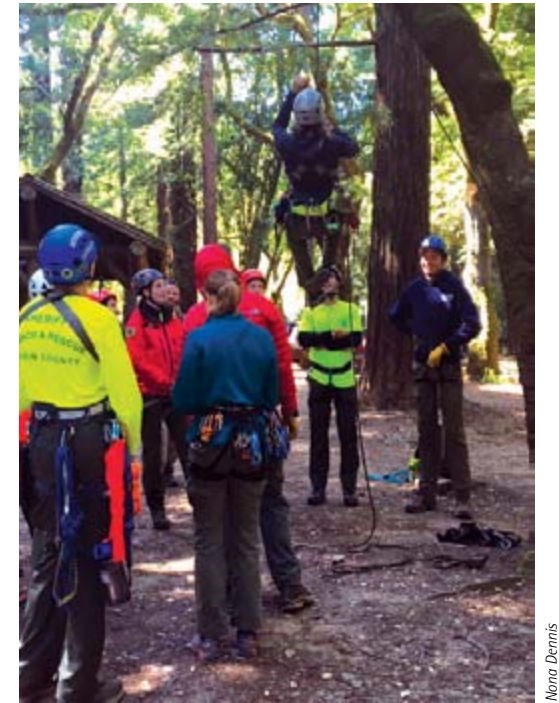
MSAR volunteers take turns in a rope climbing exercise during a training day.