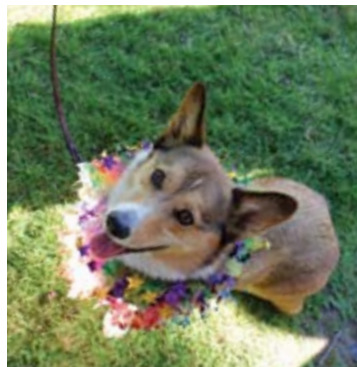
Below: Well behaved dogs, like Rhys, are always welcome!