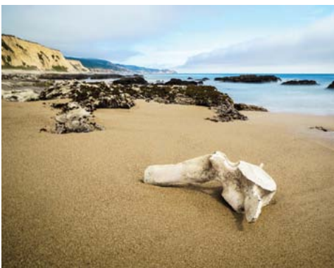
A whale vertebra on Limantour Beach.