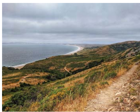
Woodward Valley Trail- the area where the Woodward Fire began.