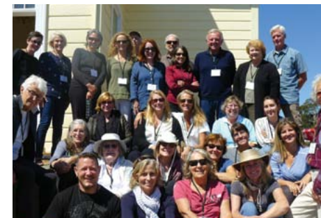
EFM Master Class 45