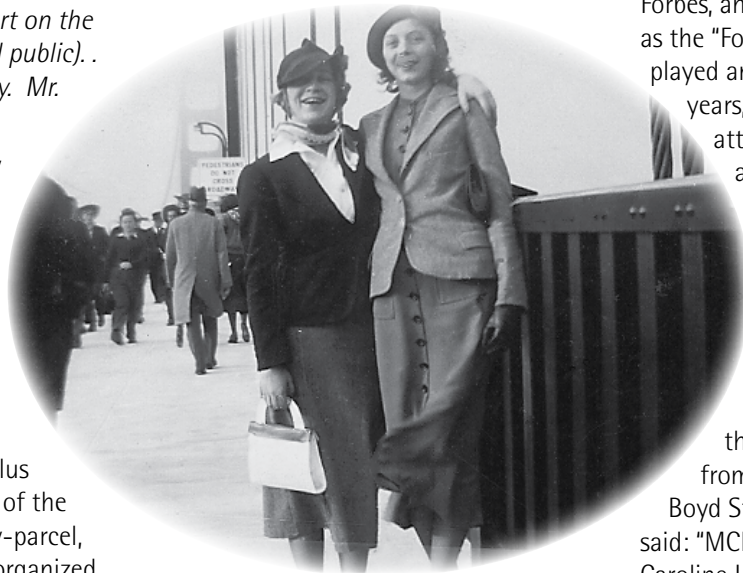
Marin Girls Having Fun in the Fog—Golden Gate Bridge Opening Day