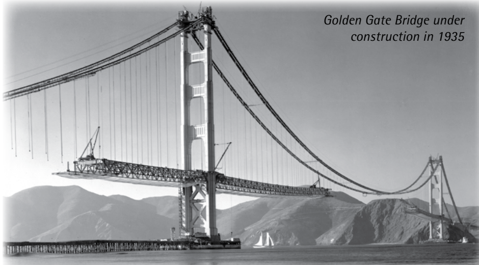
Golden Gate Bridge under construction in 1935

Marin in 1934 was still pastoral. There were hundreds of dairy and beef ranches spread across the County, even along the corridor where the new Redwood Highway was taking shape but was far from complete. Indeed, until 1931, when the Richardson Bay Bridge was opened, the highway snaked over the maddeningly slow curves of Camino Alto, and through each town in the Ross Valley. Residents still traveled mostly by rail, with ferry connections to San Francisco and Richmond.