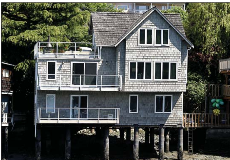
Stilt homes would be an example of adaptation to rising sea levels

If CARB rules are authorized as expected in late October, they will go into effect in 2013. In future issues, MCL will provide more