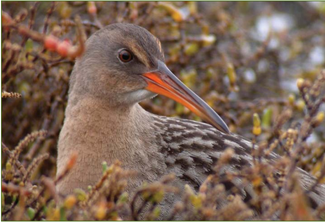
The tidal marsh bordering Gallinas Creek serves as habitat for the federally endangered California Clapper Rail.