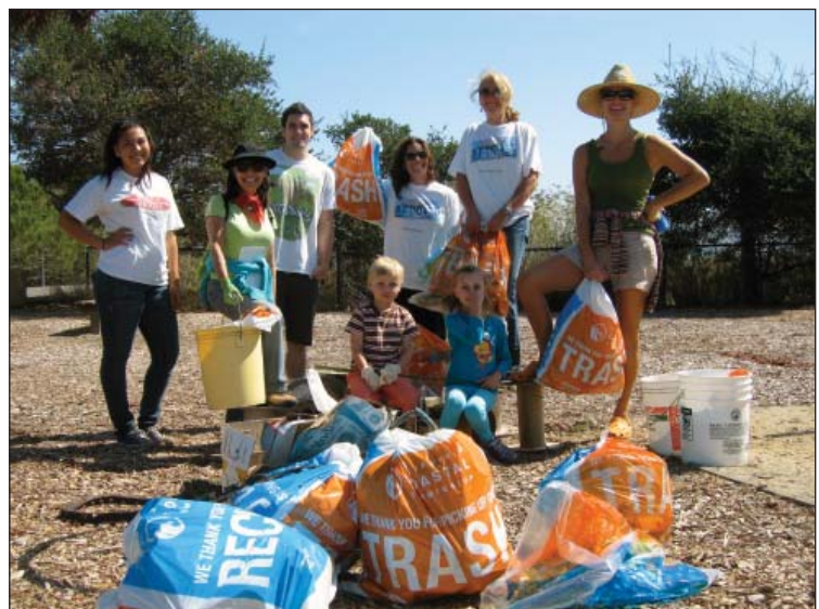
The Starkweather Shoreline Path Crew

California Coastal Cleanup Day is part of the International Coastal Cleanup organized by Ocean Conservancy and takes place every year on the third Saturday in September. We hope to see you next year!