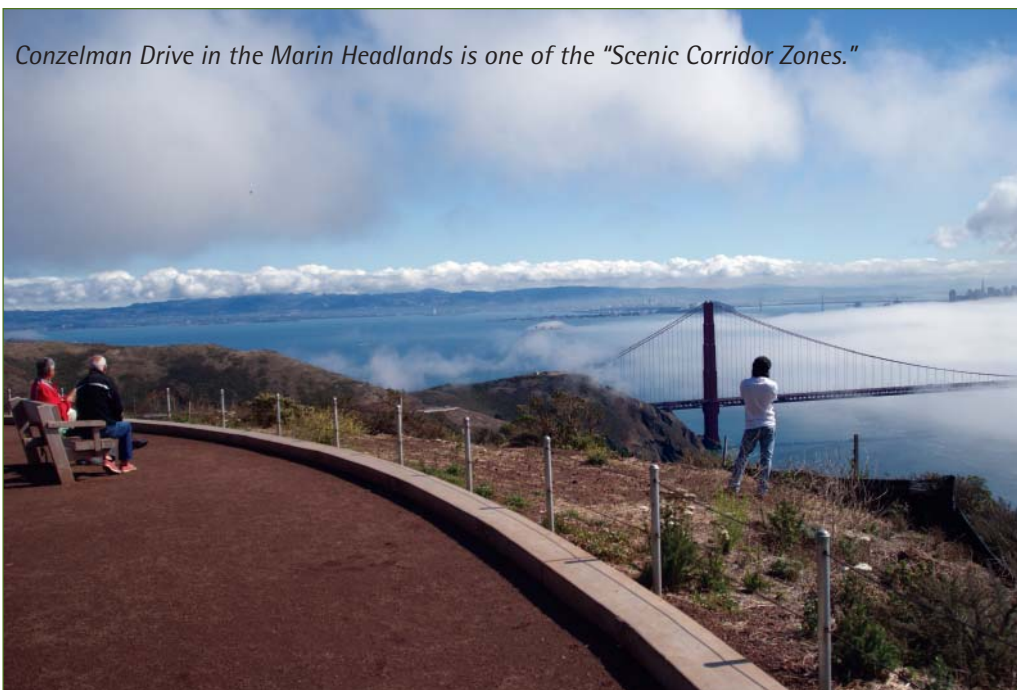
Conzelman Drive in the Marin Headlands is one of the "Scenic Corridor Zones."

Beyond these broad themes, the heart of the GMP lies in the Management Zones that are appropriate to the sensitivity, history and visitor opportunities for each site or segment of the Park. For example, State Route 1 and Panoramic Highway, and Conzelman, Bunker, and McCullough Roads are in "Scenic Corridor Zones." Muir Beach and the uplands of the Marin Headlands are all in "Natural Zones" where the emphasis is on retaining natural characteristics and ecological functions, while providing for appropriate visitor experiences. In contrast, Stinson Beach, Slide Ranch (developed portions), and Tennessee Valley trailhead and stables are designated "Diverse Opportunity Zones" to accommodate recreational,