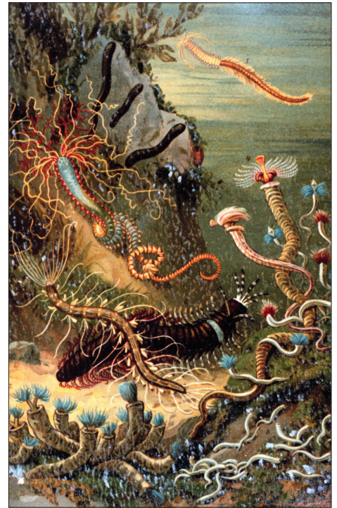
Disenfranchised polychaetes: "Borstenwurmer des Meeres": A variety of marine worms. In: "Das Meer" by M. J. Schleiden, 1804-1881. Treasures of the NOAA Library Collection.