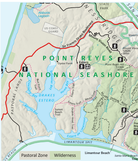
Tule elk released into the Limantour Beach area of the Wilderness in 2001 have since migrated into the pastoral zone.