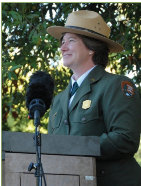
National Park Service

Seashore staff also has taken a number of steps to deal with the problem of elk encroachment onto ranches in the short term and will continue these in 2014. They include experimental fencing, such as electrical fencing and/or increasing fence height; assisting ranchers with fence repairs; hazing animals to guide elk away from C Ranch to non-grazing areas; developing water features away from ranches, where animals will congregate; relocating some individuals back into Limantour Wilderness Area; rounding up problem animals; and working with California Department of Fish and Wildlife (CDFW) elk experts and studying management of other elk preserves around the state. Press said that various population control methods have been tested and all options are "open"; none are simple, however.