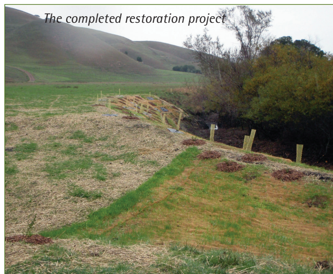
The completed restoration project