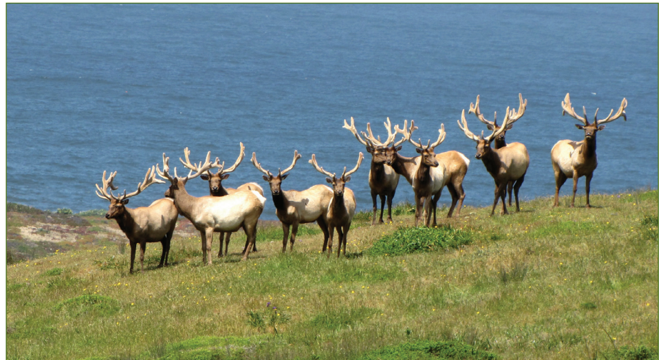
Tule elk bulls west of Sir Francis Drake Blvd.