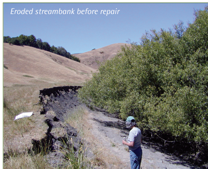
Eroded streambank before repair