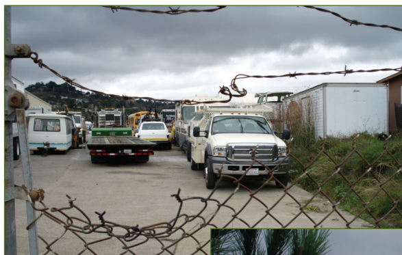
The proposed Greenway would be constructed in a straight line that straddles the grassy slope between the railroad right-of-way and the mobile home park driveway, at left in photo below. The junked vehicles (left) belonging to a tow yard currently leasing the property would be removed.

The proposed Greenway would occupy a narrow portion of the former railroad right-of-way that has long been developed and is now leased to tenants of SMART who operate a junked vehicle storage yard, a tow-truck parking lot, a cement company,