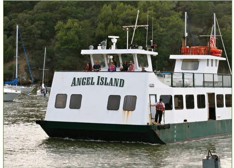
The Angel Island is the Angel-Island Tiburon Ferry Company's open-air vessel.

by 1100 feet to create a 4400 runway to accommodate "critical aircraft," but the environmental effects were not studied at that time.