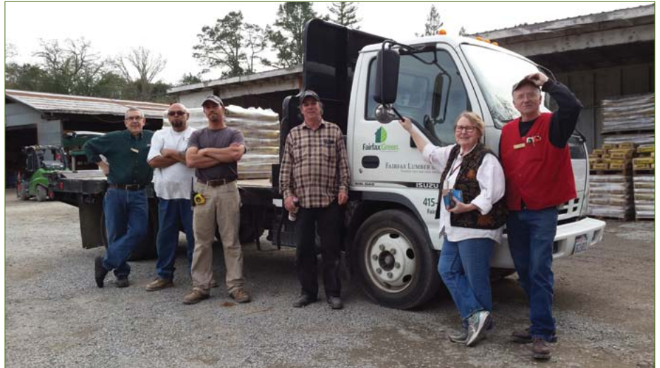
Employee owners of Fairfax Lumber & Hardware, 109 Broadway, Fairfax

These core environmental values are demonstrated through the company's Fairfax Green Program, which features sustainable timber products certified by the Forest Stewardship Council, an organization focused on the responsible management of forests worldwide ( us.fsc.org ). And it's not just the lumber department that provides environmentally friendly products along side more traditional products. The entire store gives customers alternative "green" choices, and its experienced staff is always available to guide customers' choices. To back up its environmental commitment to the community, the company showcases educational programs in the "growing greener" arena. Recent topics have included home canning, integrated pest