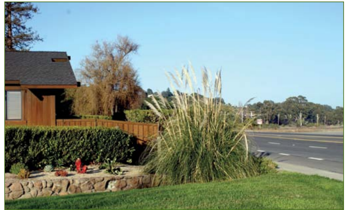
Ornamental jubata ("pampas") grass on Point San Pedro Road (top) and invading nearby wetlands (bottom).

Working in cooperation with members of California Native Plant Society (CNPS), the group is examining local general plans, policies, and ordinances to determine how effectively Marin's cities and towns are addressing the pernicious spread of invasives within their boundaries. Individual committee members have assigned themselves one or more of the eleven jurisdictions to determine whether invasive plant policies exist; if so, whether they have been programmed for action; and whether there is the political will and budget to support action. The group is also identifying other non-profits with a similar interest in abating invasive weeds and restoring native flora, and looking for their support in taking action to push every city and special district to develop an effective weed management program on both public and private lands, with funding, staff, and results. The committee members are also urging local towns and cities to allocate some of their Measure A "Parks, Open Space and Farmlands" funds to weed management.