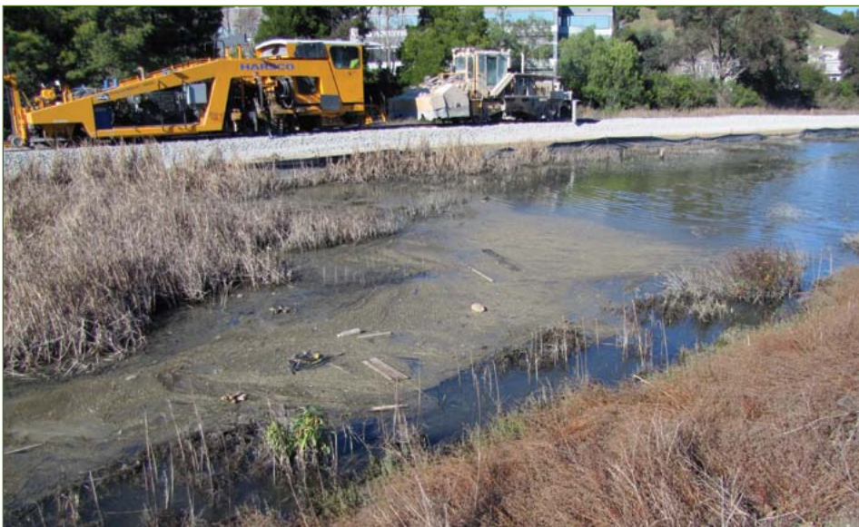
Debris and pollutants from SMART construction in Gallinas Creek, January 2015.

As track work advanced, neighbors observing the construction process raised concerns to the SMART Board and to the regulatory agencies about falling silt barriers, sediment drift during rains, chemically treated timber ties added at crossings (not in the permit), and heavy and noisy work along areas known as habitat for the federally protected Ridgway's Rail (formerly California Clapper Rail), Salt Marsh Harvest Mouse and Black Rail. This habitat area is noticeably lacking any