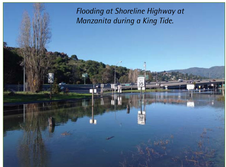
Flooding at Shoreline Highway at Manzanita during a King Tide.

County Planning Manager Jack Liebster compares the coalescing of adaptation planning efforts to the forming of a crystal: as molecules begin growing on the surface of the crystal, it keeps on getting bigger until it reaches equilibrium. That is where adaptation planning is heading. Given