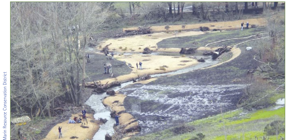
Marin Resource Conservation District

forward to a possible "correction" in terms and facts across federal agencies. The large majority of the MRCD's projects funded through the state by EPA federal dollars are designed to save pastureland and protect water quality by preventing erosion and curtailing runoff, typically by fencing off and restoring creek beds. MRCD also collaborates in the Marin Carbon Project, which is conducting research to determine opportunities for and benefits of carbon sequestration, a project that directly supports Governor Brown's statewide Healthy Soils Initiative.