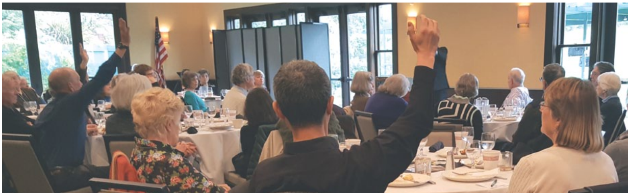
Senator McGuire responds to questions at MCL's Business-Environment Breakfast.

The central interest, however, was in possible threats of the Trump Administration for California and the state's strategies for dealing with them. McGuire sees the main battle with the Trump Administration as one of constitutional values and how to uphold them. The daily skirmishes distract