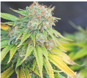
Senator McGuire's district faces huge challenges since the legalization of pot.

MCL encourages members and others to contact Senator McGuire either directly or through his staff in Marin or Sonoma County at sd02.senate.ca.gov , or at (415) 479-6612.