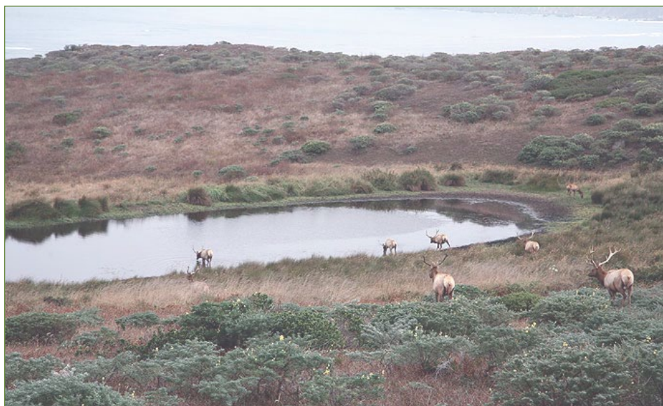
Tule elk at watering hole on Tomales Point