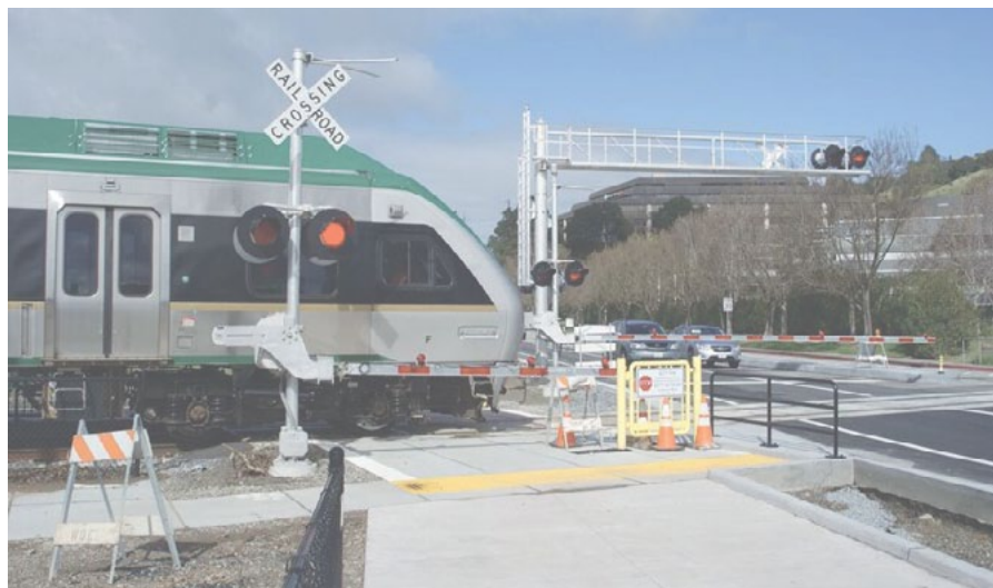
An updated Transportation section in Community Marin will take into account the operations of SMART, shown here leaving Civic Center Station

By 1997, conditions in the County were changing and it was time to update Community Marin. Some land use issues had been decided, not necessarily as hoped. The Buck Center was approved and constructed. Novato passed an Urban Growth Boundary to contain development from going north. The first homeowners had moved into the redeveloped Hamilton Field. The Black Point battle had been lost, and LucasFilm had won approval for another phase of development, in spite of serious zoning issues. Bel Marin Keys' Unit V 1,600 acre expansion site was purchased by State Coastal Conservancy for eventual tidal restoration, even as wetland restoration plans were taking shape at Hamilton. The St. Vincent's/Silveira Ranch