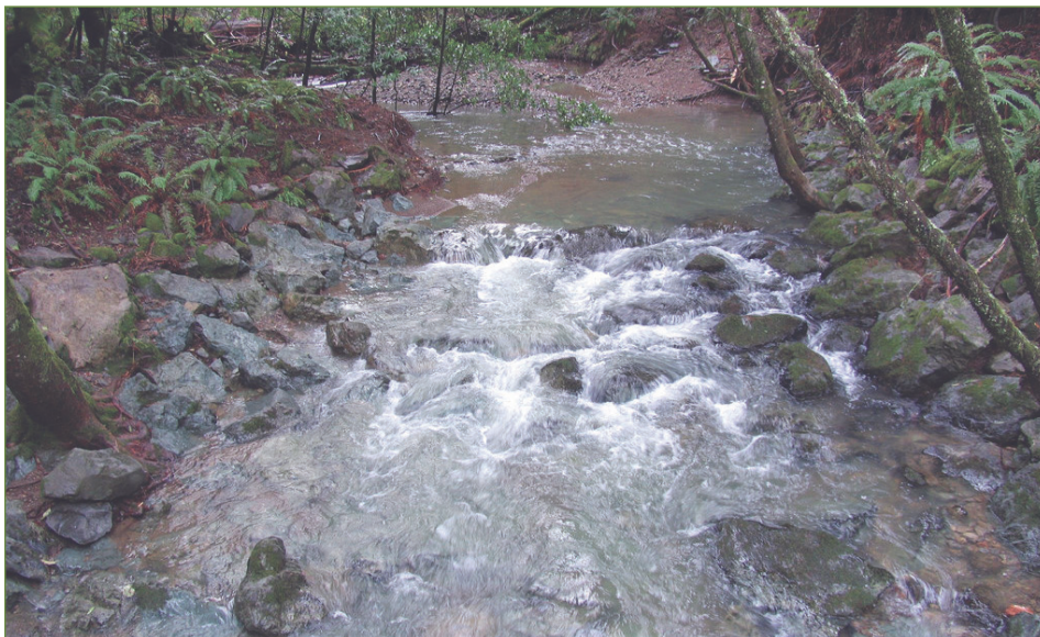
The Salmon Enhancement Project would remove many large boulders that stabilize the banks of Redwood Creek.

Muir Woods. At a public meeting in April, NPS environmental staff explained the three-part project to 1) remove many of the large boulders that were installed to stabilize creek banks by the California Conservation Corps in the 1930s, to restore a more natural stream processes; 2) strategically place large woody debris, like already-fallen trees, in the creek to create pools and refuge for juvenile fish; and 3) replace four aging bridges that cross the creek and connect trails with upgraded new structures. These tasks are complicated by the extraordinary sensitivity of the resources that must be protected during construction, while, at the same time, accommodating a continuing stream of visitors. Projects will be phased over several construction seasons. Portions of the creek will be temporarily dewatered during the low flow season, and staging areas will be established at Alice Eastwood Camp at one end, and the entry Plaza at the other. The EA contains details and is available on line at https://parkplanning.nps.gov/projectHome.cfm?projectId=62983 Comments on the EA are due by May 18, 2017.