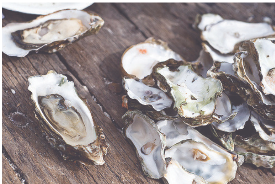
With increased ocean acidity, it takes more energy to form shells.

The ocean acts as a sponge for excess atmospheric CO 2 , but not without a cost. As concentrations of CO 2 have risen in the past 200+ years since the industrial revolution, surface ocean pH is estimated to have decreased from 8.2 to 8.1 on a log scale, representing an increase in acidity of almost 30 percent. Acid levels differ widely across the earth's oceans, varying with temperature and depth and many other factors, but in combination