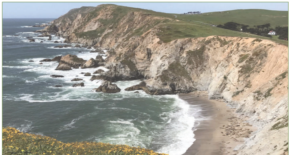
Acidification is complicated by upwelling of deep waters along the California Coast such as offshore Point Reyes National Seashore.