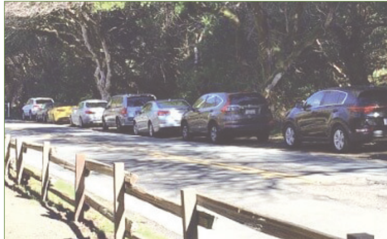
Under the MOU, parking eventually will be eliminated from the roadside.

traffic, as it is intended to do, congestion and parking along the road toward Muir Beach will be unavoidable. Traffic woes for local residents have been exacerbated by this winter's closure of Shoreline Highway, with no relief expected until repairs are completed.