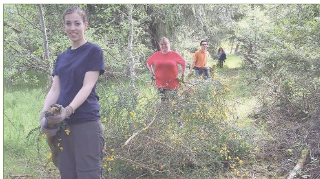
Marin County Parks

invasive plant species on 30 preserves. Fourteen projects are on Ring Mountain Preserve alone. The majority of projects qualify as "maintenance" – treating infestations that can be controlled by "organic" methods, i.e., by repeated hand pulling supplemented with power tools, or in limited cases, by goat grazing or propane flaming, and in very small areas, covering plants with plastic. In 17 projects, however, the plan recommends strategic use of "conventional products," i.e., selected herbicides. Most of these are in fuel breaks that must be kept clear of broom thickets