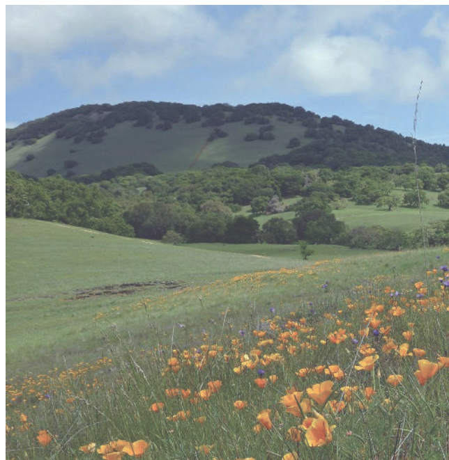
Marin County Parks

Mount Burdell, the largest preserve in the Open Space District at 1,627 acres, is also the fifth tallest of Marin's hills and mountains (1,558 ft.).