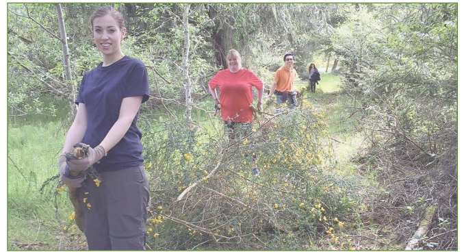
Volunteers tackle an infestation of broom.

This spring, staff has developed an ambitious work program for 2017-2018 that lists 85 projects targeting about two dozen invasive plant species on 30 preserves. Fourteen projects are on Ring Mountain Preserve alone. The majority of projects qualify as "maintenance" - treating infestations that can be controlled by "organic" methods, i.e., by repeated hand pulling supplemented with power tools, or in limited cases, by goat grazing or propane flaming, and in very small areas, covering plants with plastic. In 17 projects, however, the plan recommends strategic use of "conventional products," i.e., selected herbicides. Most of these are in fuel breaks that must be kept clear of broom thickets