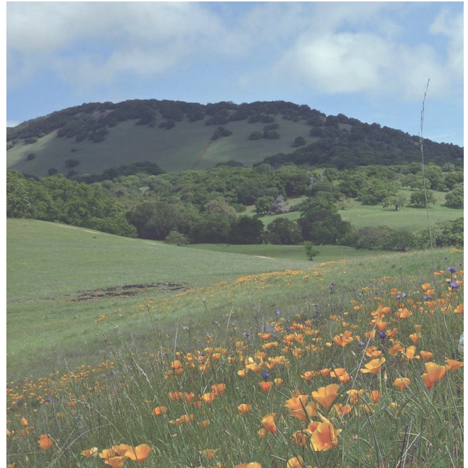
Marin County Parks

Mount Burdell, the largest preserve in the Open Space District at 1,627 acres, is also the fifth tallest of Marin's hills and mountains (1,558 ft.).