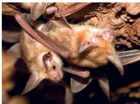
California Dept. of Fish & Wildlife

In preparation for last year's symposium, dozens of local and regional scientists, land managers, and other experts, shared their ecological knowledge of the mountain, identified gaps in that knowledge, considered the stressors that threaten Mt. Tam's ongoing health, and selected useful indicators for measuring and monitoring changes on the mountain over time. A noteworthy outcome of the 2016 proceedings was a comprehensive baseline report, Measuring the Health of a Mountain , which identified wildlife species that serve as useful "indicators" of ecosystem health of Mt. Tam, such as northern spotted owls, coho salmon, American badger, osprey, and Western pond turtle. The 2017 symposium will include updates on the status of some of these species.