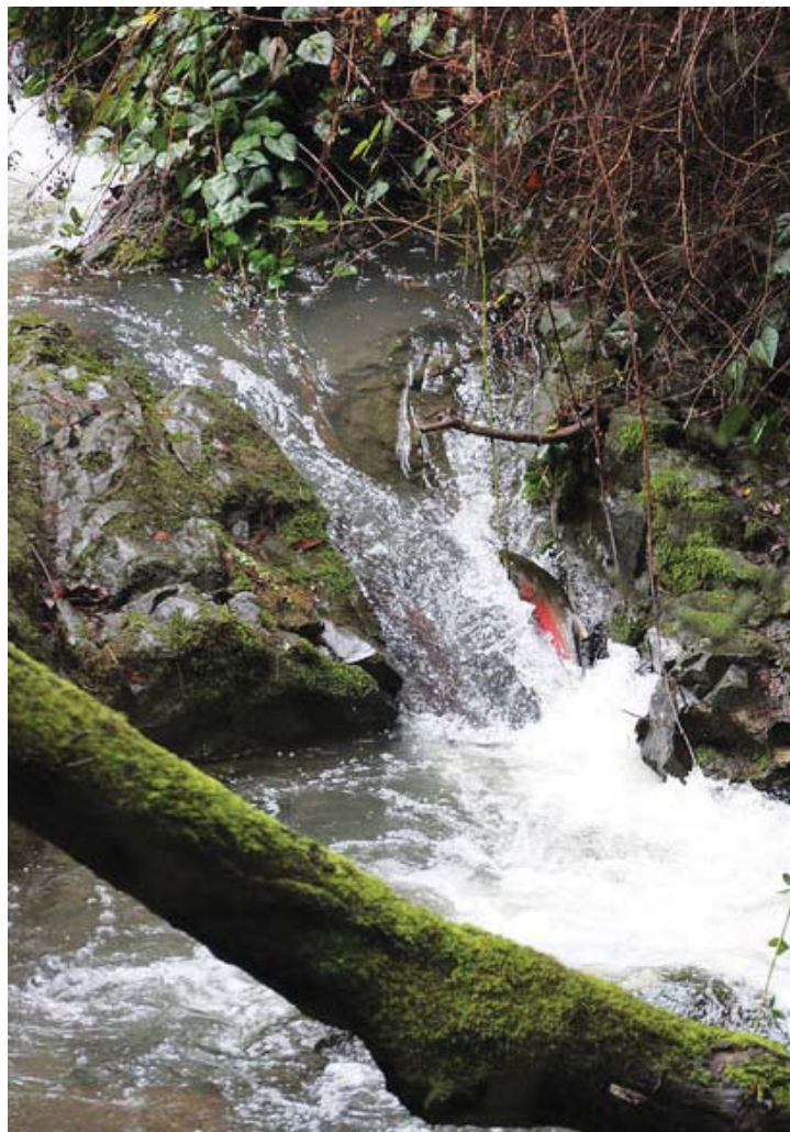
A coho salmon swims upstream in West Marin.

While some of Marin’s creeks remain relatively natural, others have undergone many changes over the past 200 years, beginning with extensive cattle ranching and logging that denuded the hillsides, then diking, damming and realigning streams to create farmland, protect built-up areas against flooding, and develop water supply. Railroads and roads were constructed, often blocking drainages. New residents to Marin County were attracted to the practical and aesthetic appeal of building their homes on creeks, and soon whole communities developed along their banks. Today, thousands of residents live either on or near creeks, and with that comes responsibilities as well as