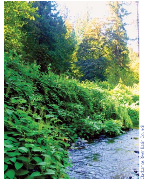
Clackamas River Basin Council

Because of its large rhizomes, which can extend 23 feet across and almost 10 feet deep, removing knotweed by excavation is extremely difficult. Knotweed vigorously resprouts from its roots after being cut. For effective eradication, rhizomes