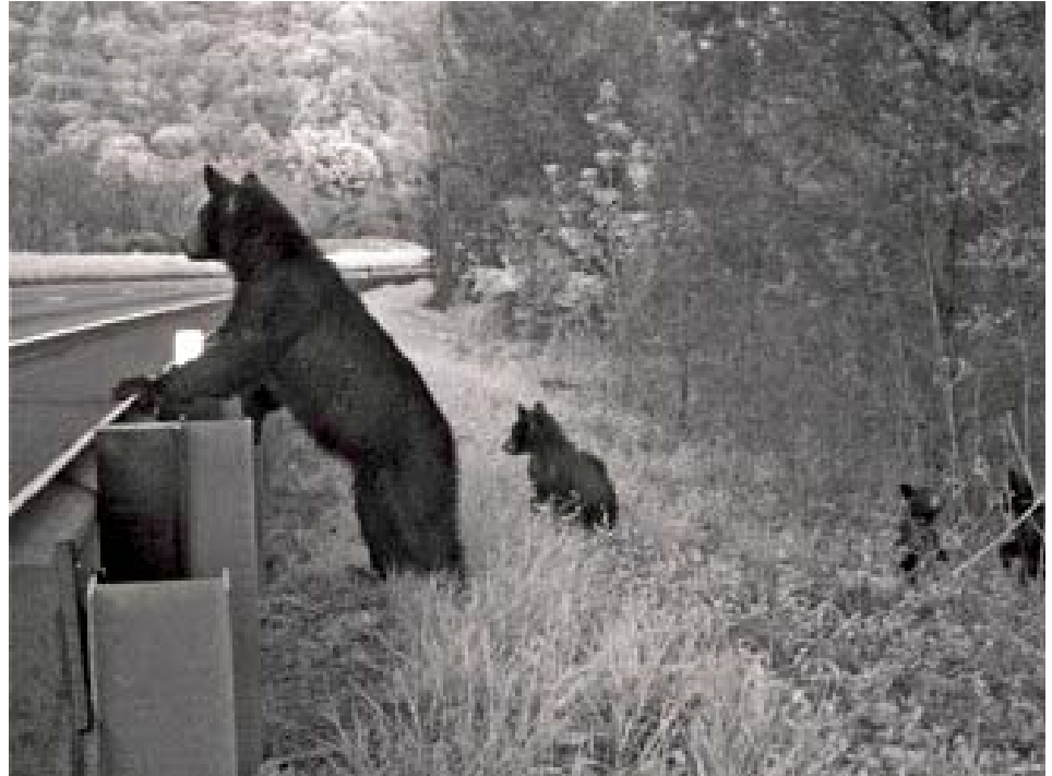
Virginia Department of Transportation