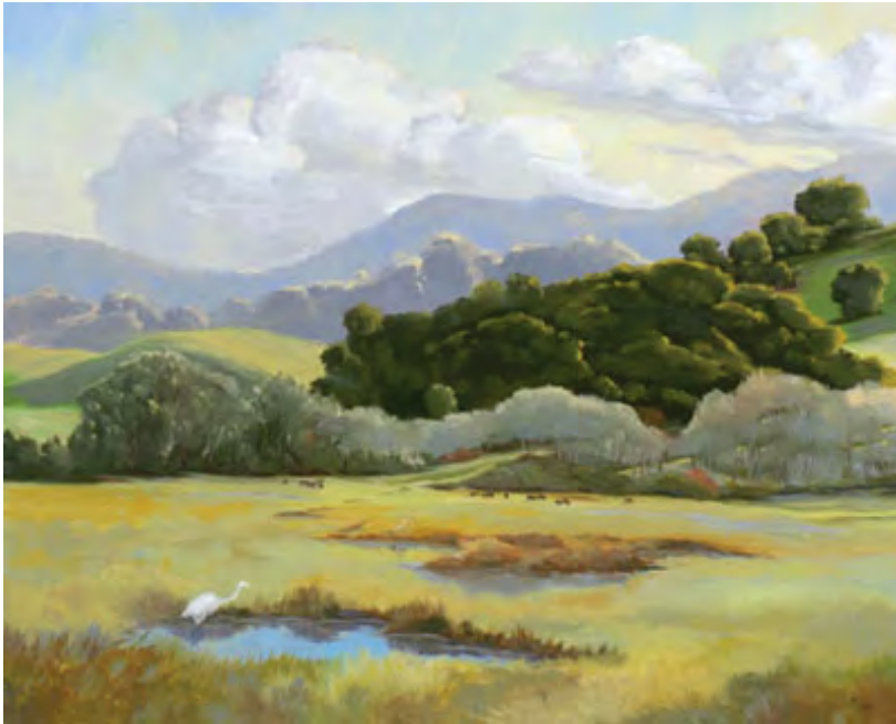
PAINTING BY ZENAIDA MOTT