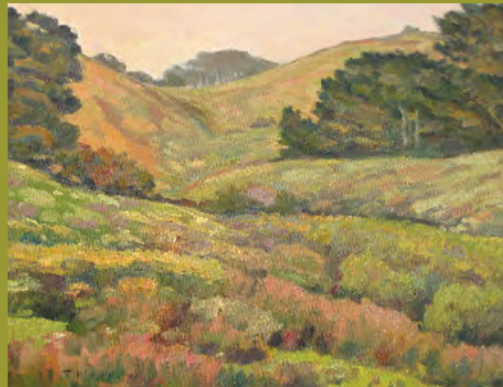
PAINTING BY TOM WOOD