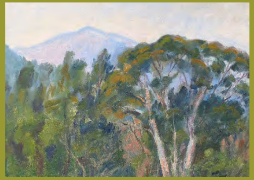
PAINTING BY TOM WOOD