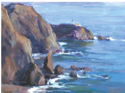
PAINTING BY TERESA DONG

January 1 to December 31, 2006 (Prepared from MCL Records)