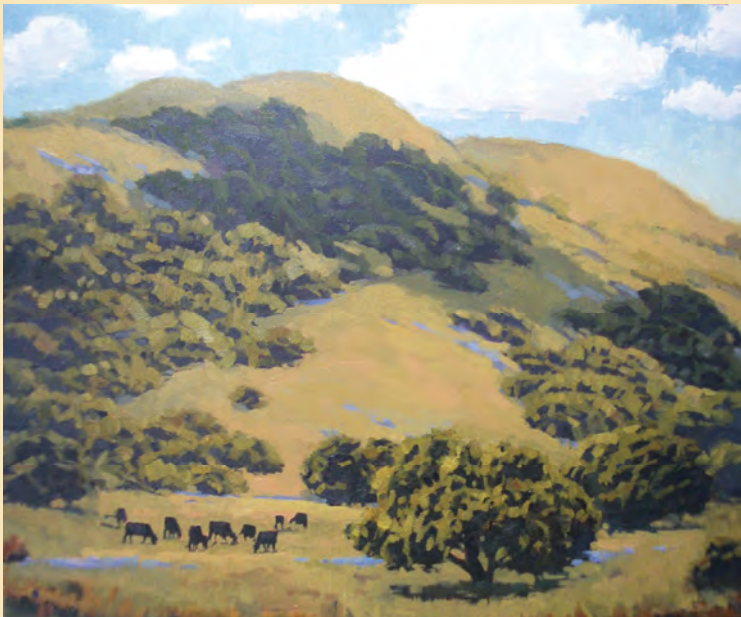
PAINTING BY TOM SOLTESZ