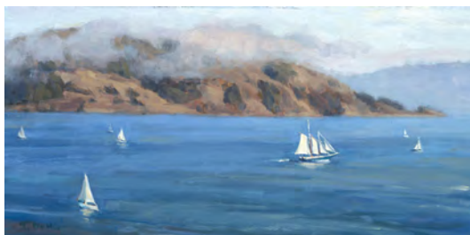
PAINTING BY TERESA DONG