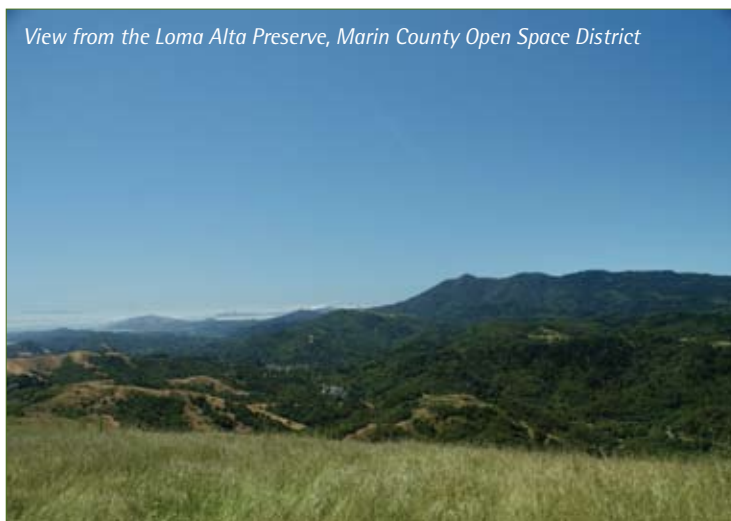
View from the Loma Alta Preserve, Marin County Open Space District