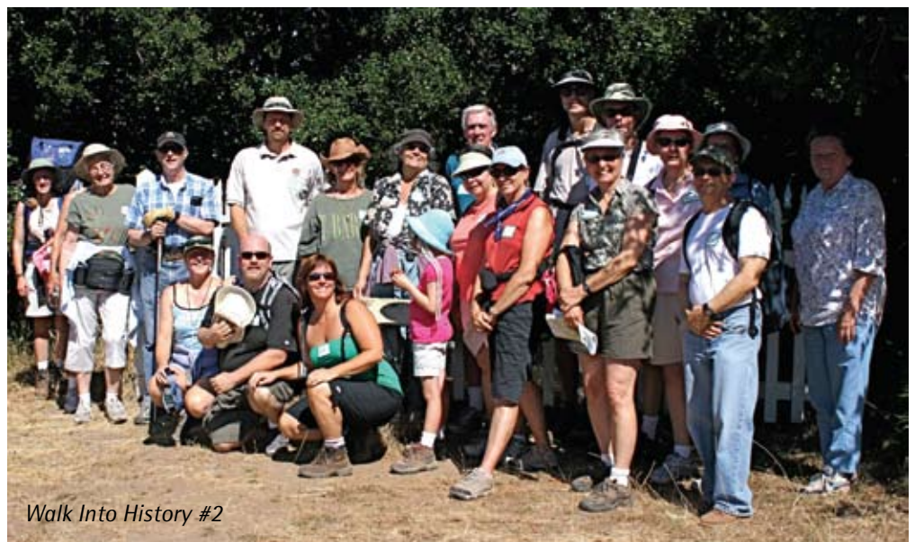
Walk Into History #2